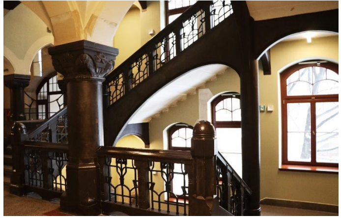
Wrocław University of Science and Technology - Faculty of Architecture, Prusa 53/55, 50-317 Wrocław, Poland